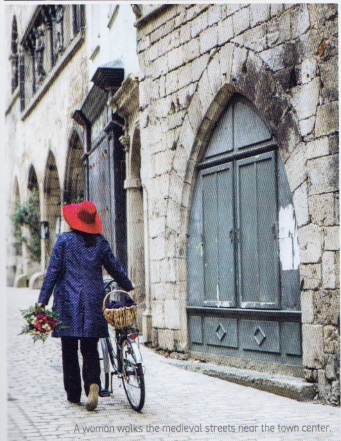
A woman walks the medieval streets near the town center.