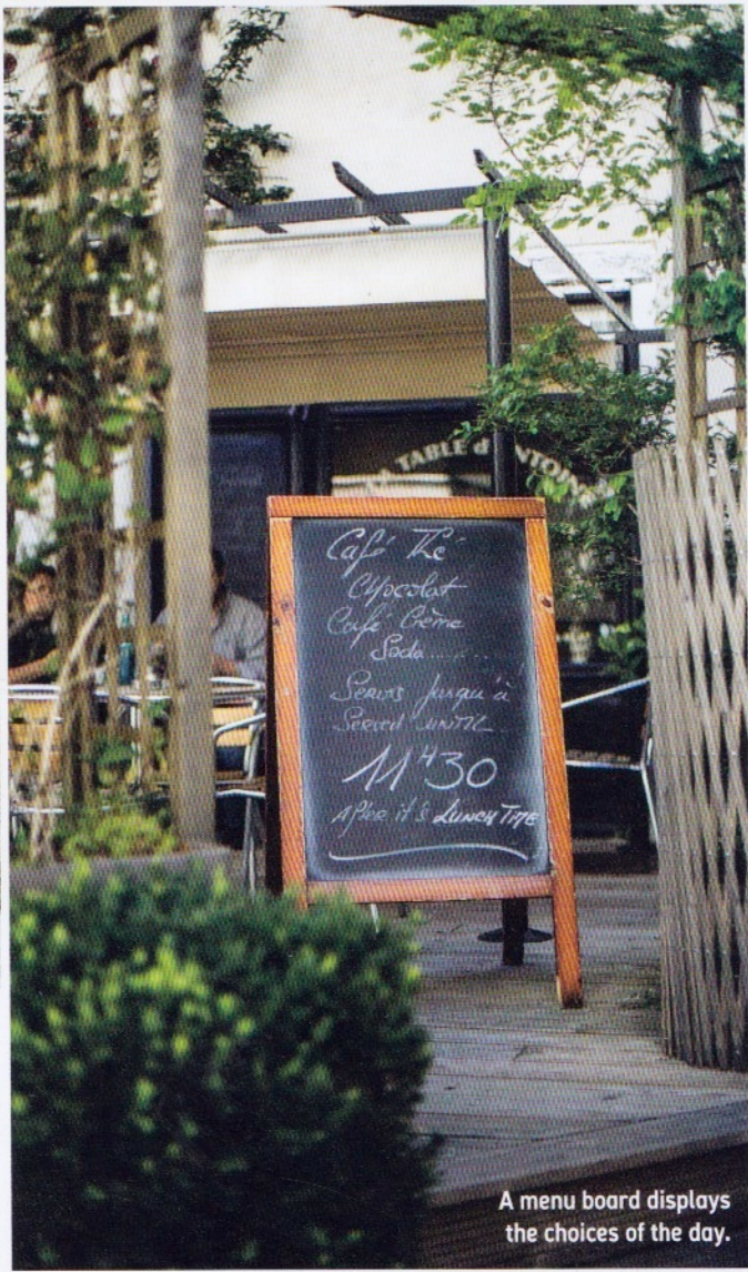
A menu board displays the choices of the day.

The vide-greniers (“rummage sales”), concerts and festivals of summer bring a vibrant bustle to Saint-Antonin. In winter, the tourists disperse, and it gets much quieter, but the locals love having their town back, and I count myself as one of them!